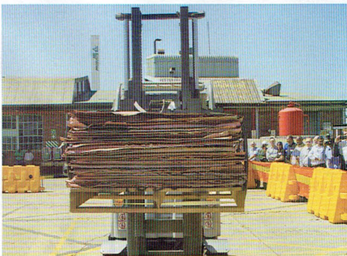
FORKLIFT Goscor Lift Truck has received new ISO certification for its forklifts