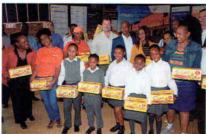
Anglo American Platinum's (Amplats) Thembelani mine donated school shoes to 338 underprivileged learners from Rustenburg ahead of the winter season. Thembelani mine joined forces with Transnet Freight Rail, U-Bank and the company's contractors, namely GST, Lesedi and Kern, to provide the school shoes. Transnet Freight Rail will also provide shopper bags with stationery for the learners