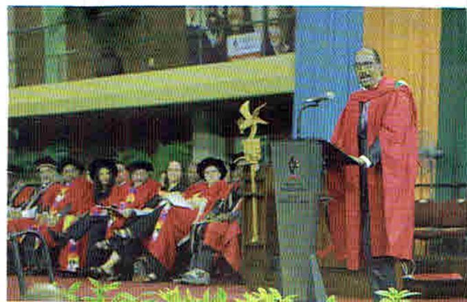
UNAids executive director Dr Michel Sidibé last month received an honorary doctorate in recognition of his contribution in the fight against Aids from the University of KwaZulu-Natal (UKZN), the first university in Africa to award him with an honorary degree. The Malian-born campaigner has been at the forefront of the global campaign to eliminate mother-to-child transmission of HIV and to eliminate HIV infections among children