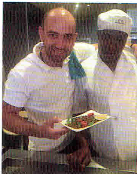
Cape Town played host last month to the launch of the 2016 International Year of Pulses, which aims to heighten public awareness of the nutritional benefits of pulses as part of sustainable food production, ensuring food security and nutrition. Pulses include beans, chickpeas, lentils and peas, which are all considered nutritional powerhouses. Pictured are chefs from greek restaurant Mezepoli, which hosted the event